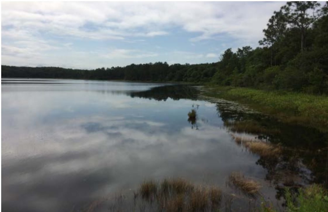
Figure 4 – VIEW FROM WEST SIDE AFTER