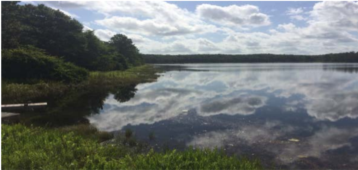
Figure 2 - BOAT RAMP LOOKING SOUTH AFTER