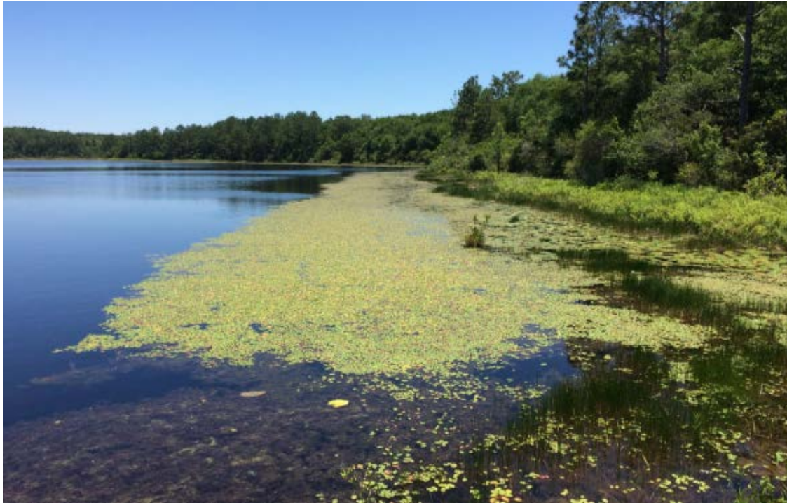
Figure 3 – VIEW FROM WEST SIDE BEFORE

The Lake Doctors, Inc. Aquatic Management Services ®