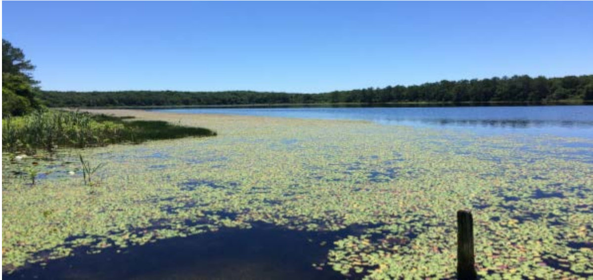
Figure 1 - BOAT RAMP LOOKING SOUTH BEFORE

The Lake Doctors, Inc. Aquatic Management Services ®