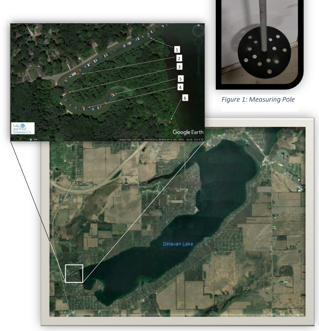
Figure 2: Close up of Viewcrest Channel on Delavan Lake.

With the recordings made, a small watercraft holding two people would apply the MD Pellets by hand, starting at point 6 and working towards point 1. The pellets were spread out as evenly as possible while avoiding other watercrafts.