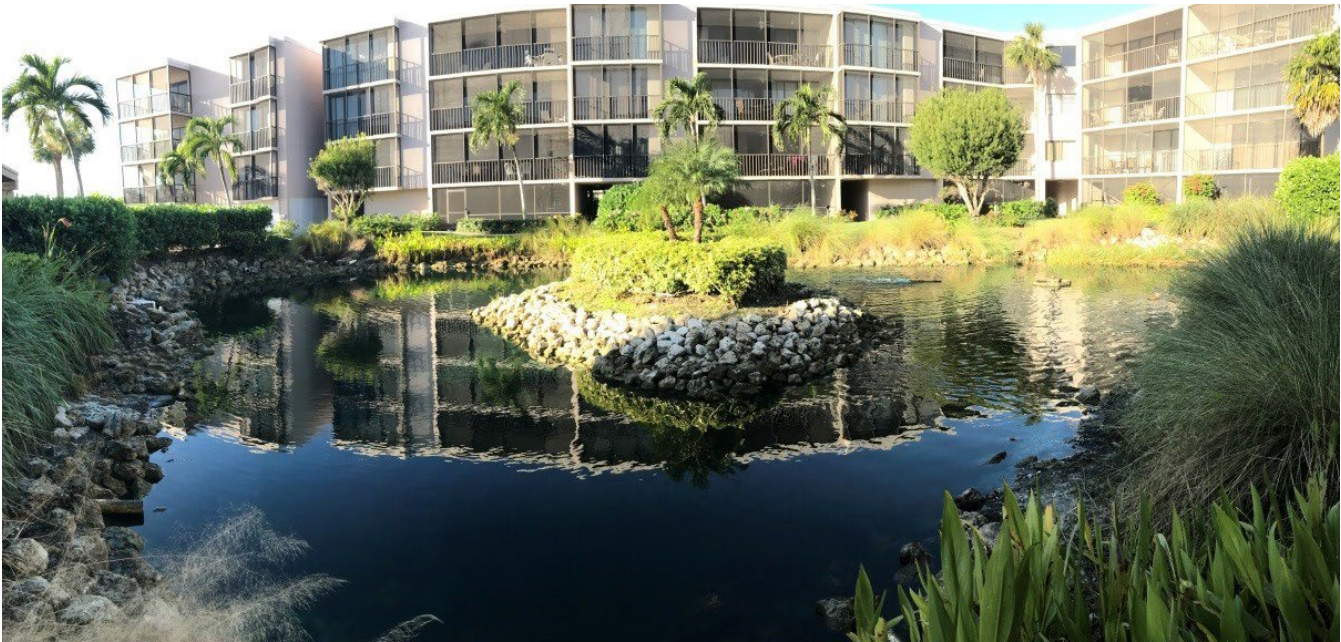
Sundial East After Circulator and Beneficial Bacteria