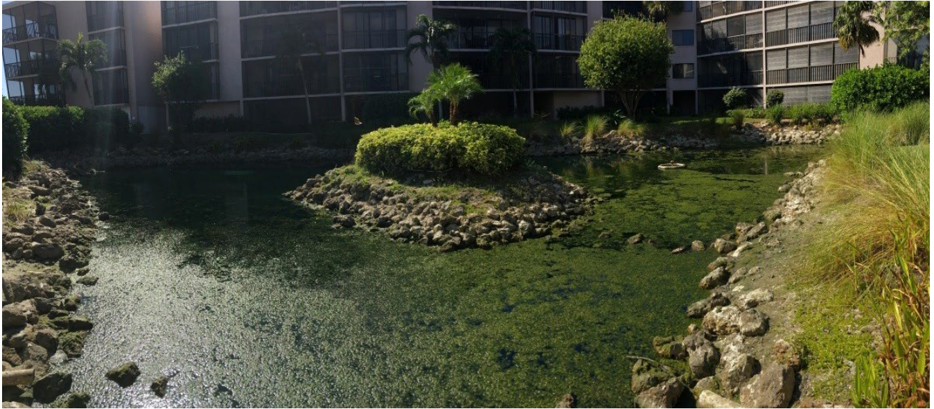
Sundial East Before Circulator and Beneficial Bacteria