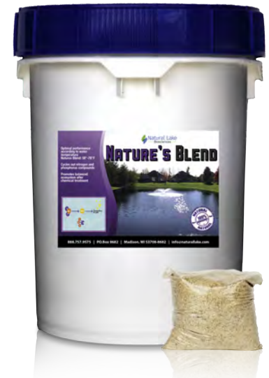
Nature's Blend is available in 10 and 30 pound containers.

Nature's Blend excels when used alone and can be applied as a dry powder or dissolved and sprayed over the surface of the water. For an extra boost, use Nature's Blend in combination with PondZilla Pro or AquaSticker.