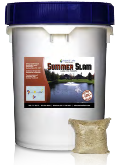
Summer Slam is available in 10 and 30 pound containers.